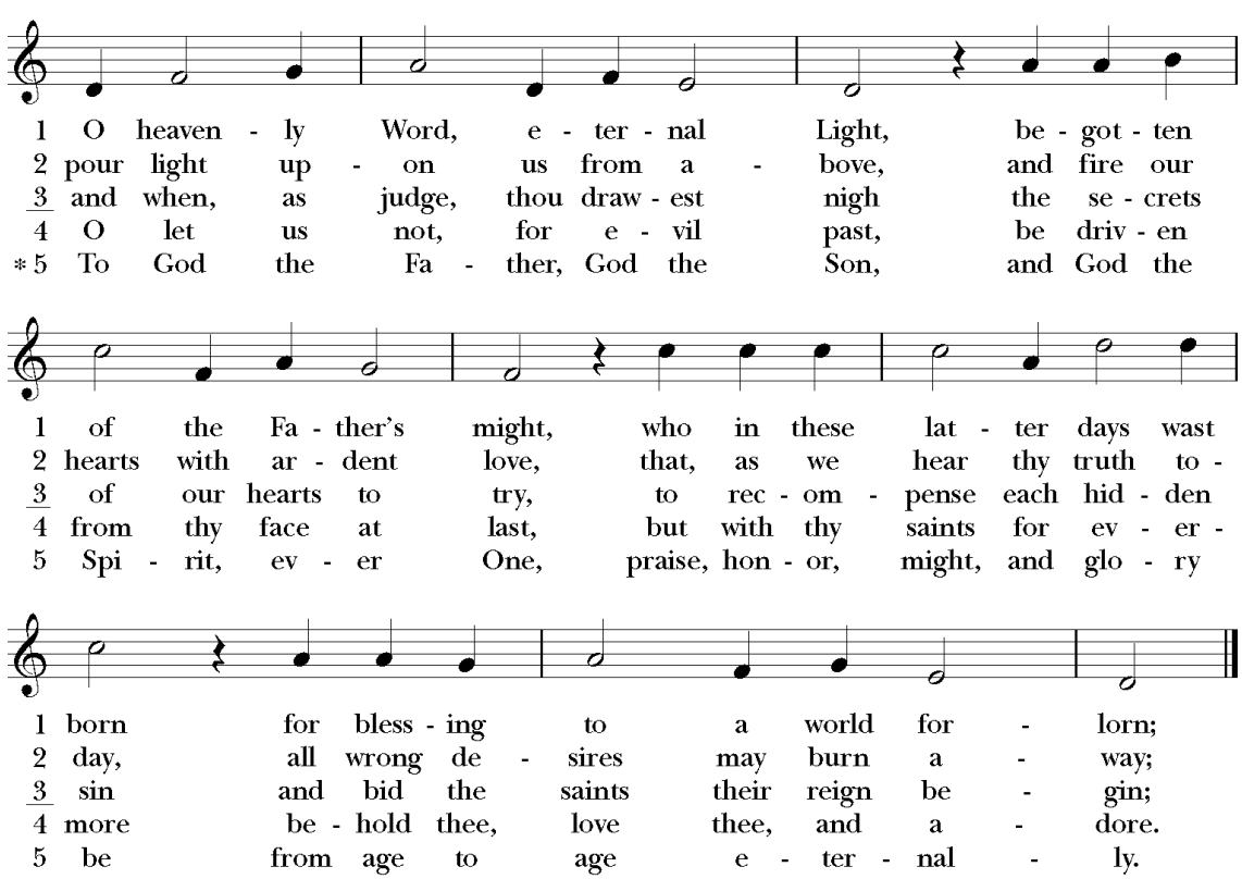
O heavenly Word, eternal Light O Heiland, Reiss