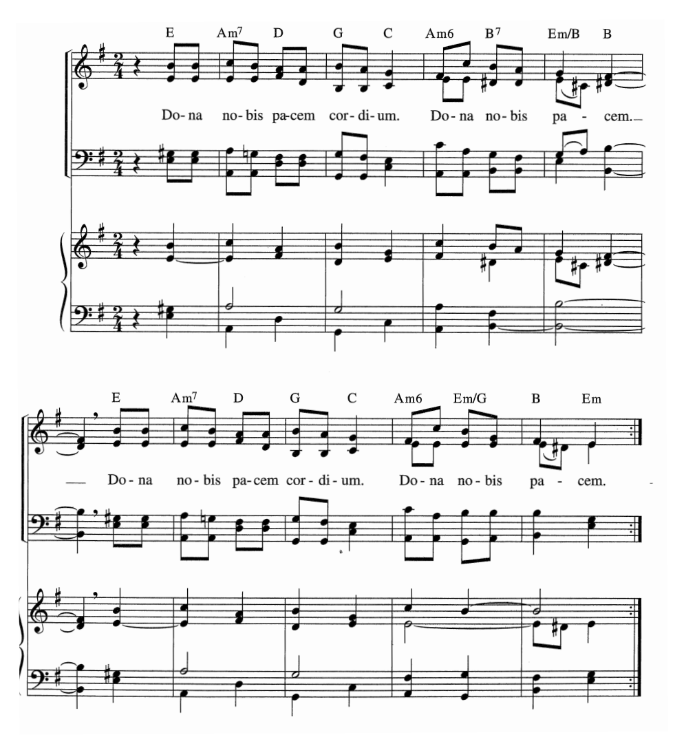
Dona Nobis Pacem 1. Piano 2. Cantor 3. All