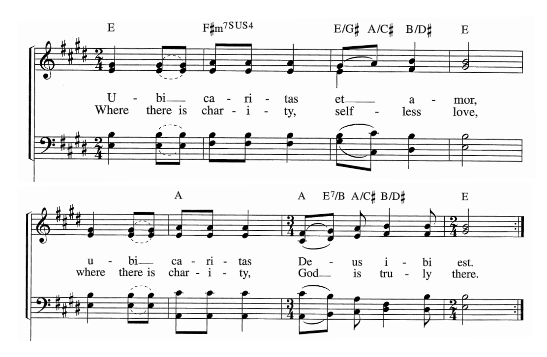
Ubi Caritas 1. Piano 2. Cantor 3. All